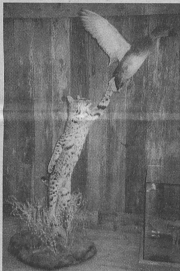
B&S offers unique mountings

The antlers are typically divided into branches and restricted almost entirely to males.